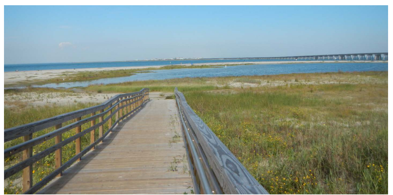
Figure 1. San Luis Pass looking toward Galveston Island.

San Luis Pass is a tidal inlet between Follets Island and Galveston Island ( fig. 1 ). A tidal inlet is a channel that carries water into or out of a bay as water levels change owing to the rise and fall of the tides. Tidal inlets facilitate the exchange of water between the ocean and a bay or lagoon. Tidal inlets allow fish and shrimp and other marine organisms to enter and leave the bay or lagoon, and they are the used by ships and smaller boats. San Luis Pass is one of two stable, natural tidal inlets on the Texas coast. The other is Pass Cavallo between Matagorda Island and western Matagorda Peninsula. San Luis Pass naturally maintains a channel that is not dredged but that migrates within the tidal inlet. Most of the other major tidal inlets on Gulf of Mexico coast are sites of sediment deposition and must be dredged to maintain sufficient depth for boat traffic as well as have had jetties constructed to stabilize the inlet entrance.