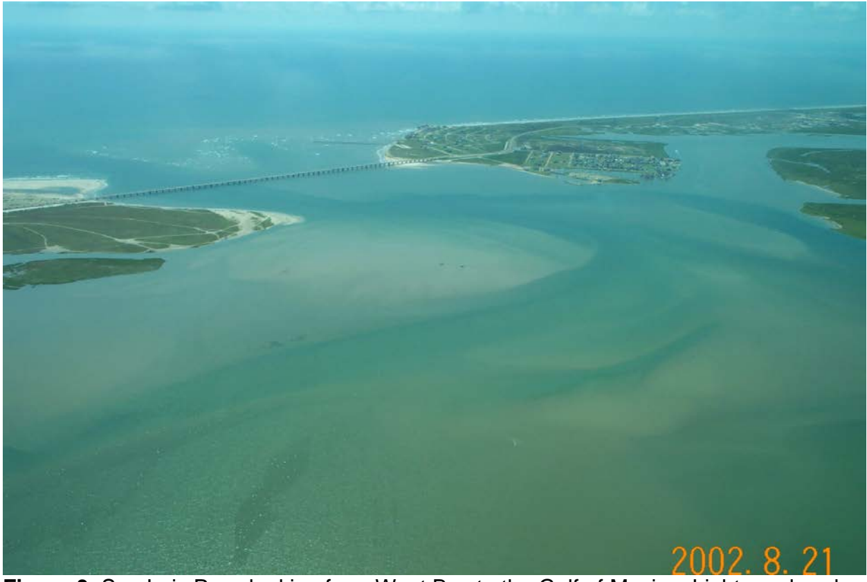
Figure 3. San Luis Pass looking from West Bay to the Gulf of Mexico. Lighter colored areas in the bay are flood-tidal delta deposits. The dark colored area through the pass is the main channel through which the tidal currents flow.

Hundreds of tidal inlets, small and large, occur along the Gulf of Mexico coast from