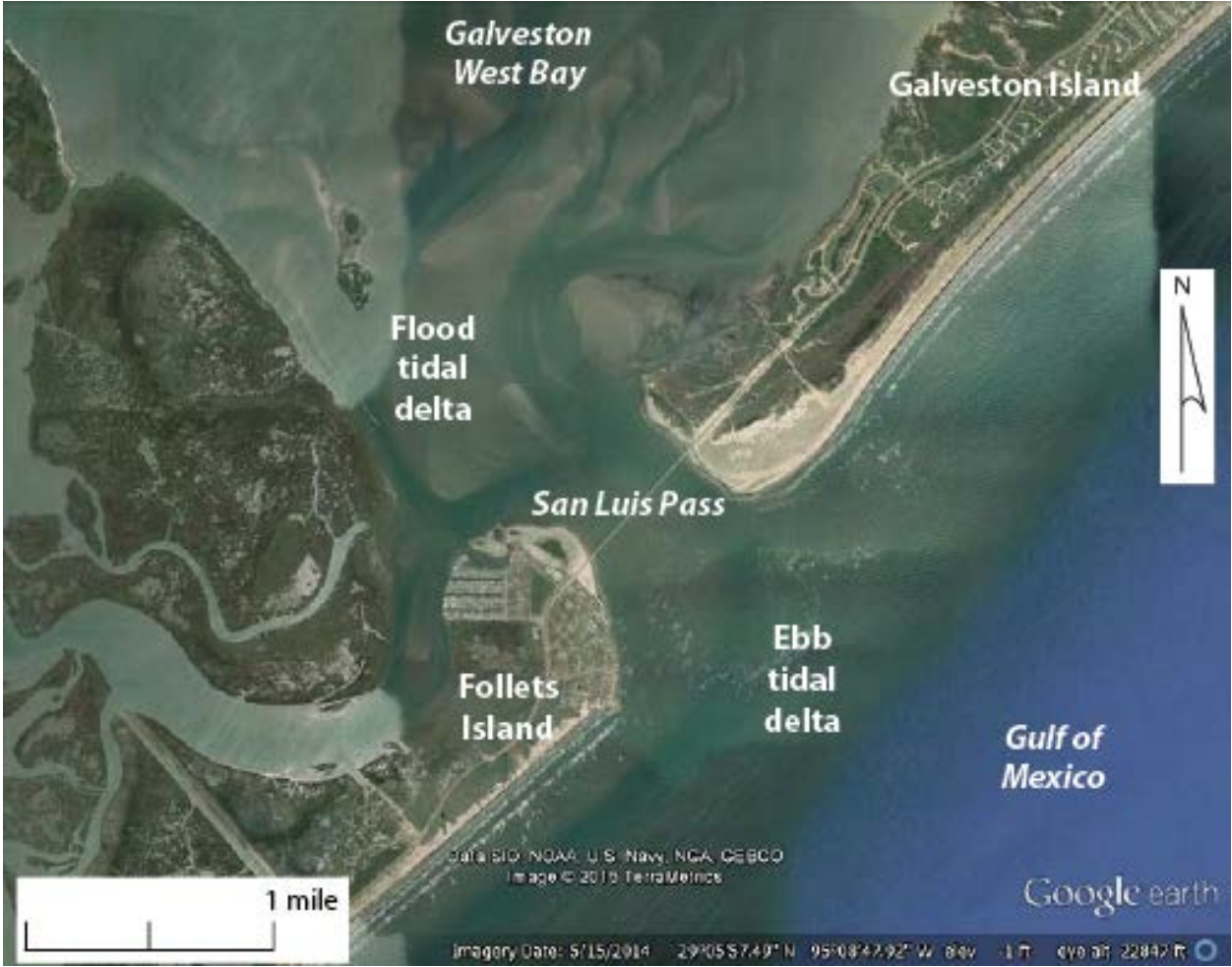
Figure 2. Map of San Luis Pass showing the position of the ebb- and flood-tidal deltas.

sediments. The current velocities are highest where the channel is narrow and slow down as the waters spread out in a bay (during a high tide, or flood tide) or in the ocean (during a low tide, or ebb tide). In an active tidal inlet, sediments are eroded and transported through the pass and then deposited at either end of the pass ( fig. 2 ). The sediment deposited near the mouth of a tidal inlet in a bay or lagoon by a flood tide is called a flood-tidal delta . The sediment deposited near the mouth of a tidal inlet in the ocean by an ebb tide is called an ebb-tidal delta . At San Luis Pass, sediment transported through the inlet by a rising (flood) tide is deposited in Galveston West Bay: sediment washed through the channel as waters recede during a falling (ebb) tide is deposited on the Gulf of Mexico end of the pass ( fig. 2 ). There is a flood-tidal delta in West Bay and an ebb-tidal delta in the Gulf of Mexico.